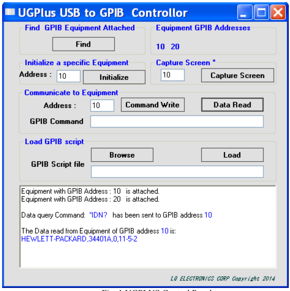
Fig. 1 UGPLUS Control Panel

If you plug an UGPLUS USB-GPIB Controller on your computer, you will see the Icon as shown in Fig.1 when you run UGPLUS.exe.